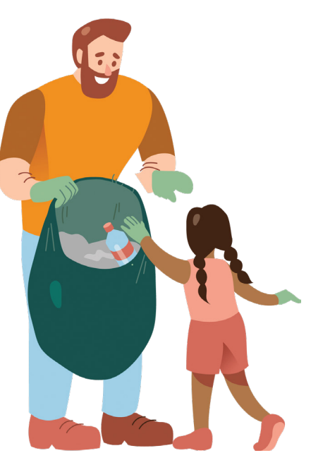
Thanks for doing your part to help keep our community clean and safe!

Pickup schedule: columbus.gov/publicservice